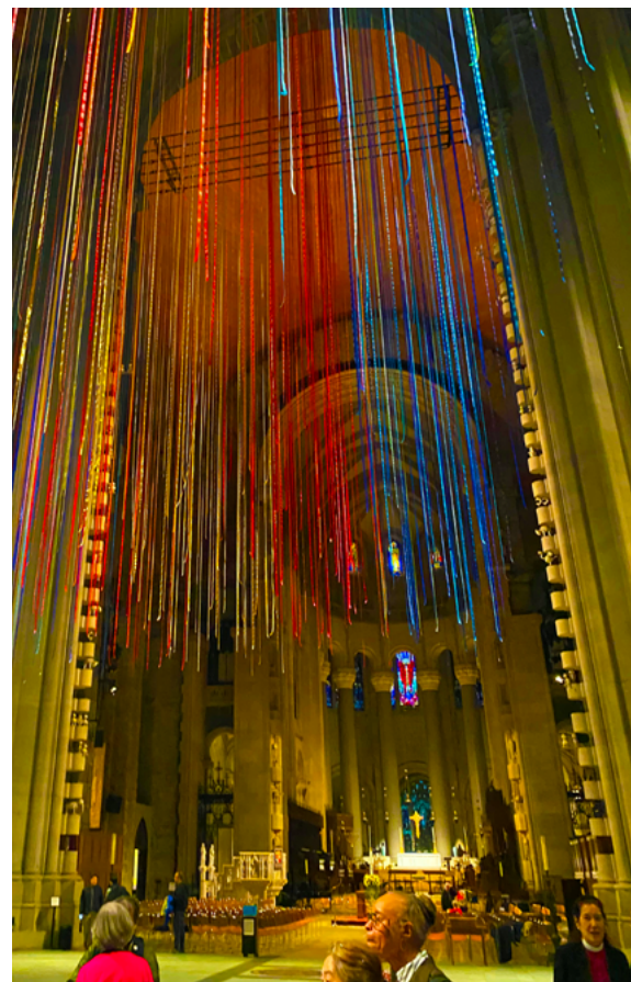
An installation of shimmering ribbons in the Cathedral Church of St John the Divine